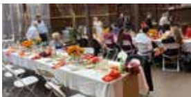
The Wedding Venue