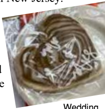
Wedding Favor Cookies!

It was fun to see the family all gathered together and the food was great. The restaurant specializes in bison! The reception was fabulous and they had a get-together with a bonfire