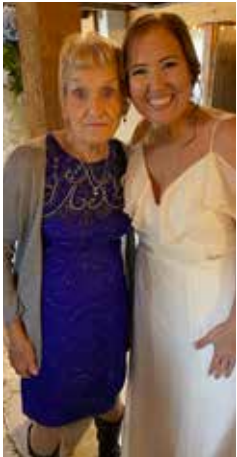
My Mother and the Bride