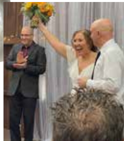
The Happy Couple!